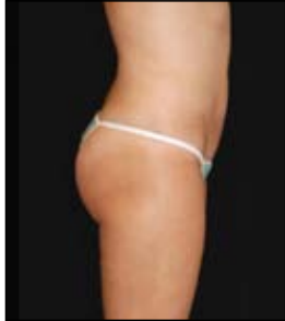
AFTER, 2 months