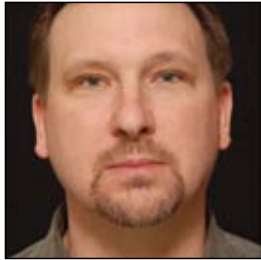
AFTER, 6 weeks