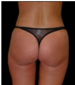
AFTER, 3 months