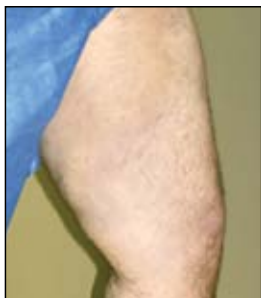
AFTER, 1 treatment